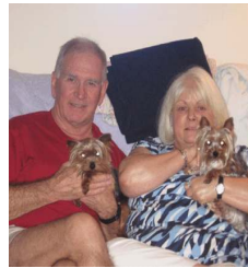
KiKi with her new mom, dad and fur-sister.

"We would like to thank Yorkie Haven Rescue for bringing another angel into our lives. Our first Yorkie Angel, Itsy, was a gift to us from a colleague at the elementary school where I was teaching and I am convinced that she